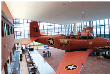
New Airport Terminal at AZO Kalamazoo, MI $35 million | 90,000-SF | 5 gates