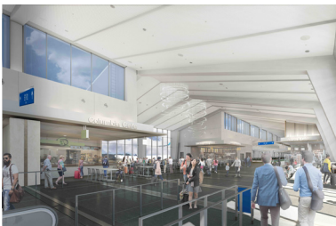
Concourse E Expansion and Terminal Rebalancing at PDX Portland, OR $176 million | 152,000-SF