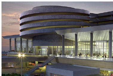
Main Terminal and Airport Concession Redevelopment Program at TPA, Tampa, FL $122 million | 250,000-SF