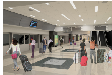
Central Passenger Terminal Complex (CPTC) Modernization - Airside at ATL, Atlanta, GA $25.7 million | 127,631-SF