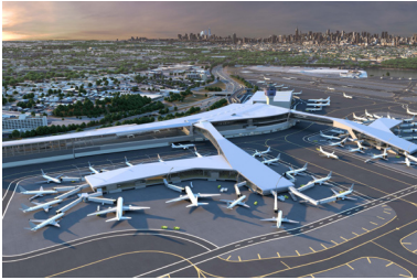
Central Terminal B Redevelopment at LGA Queens, NY $4 billion | 1.3 million-SF | 35 gates