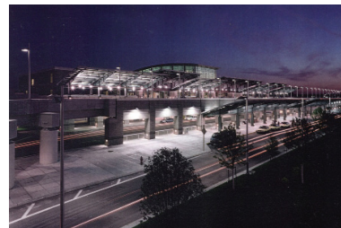
Checked Baggage Inspection System and Security Upgrades at PVD, Warwick, RI $70 million | 317,000-SF