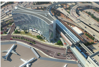
AirTrain Extension and Improvements Program at SFO San Francisco, CA $111 million