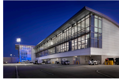
Terminal B South Side Replacement at IAH Houston, TX $150 million | 225,000-SF | 30 gates