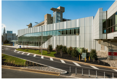
Terminal F Baggage Claim Addition and Ticketing Renovation at PHL Philadelphia, PA $49.5 million | 31,500-SF