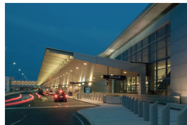
Delta Air Lines Terminal A Redevelopment at BOS Boston, MA $384 million | 686,480-SF | 25 gates