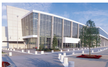
Georgia World Congress Center Various Renovations Atlanta, Georgia $846,863