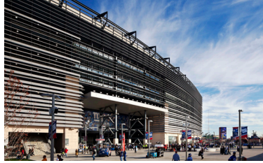
MetLife Stadium East Rutherford, New Jersey $1.15 billion | 2,200,000-SF EPA "Go Green" Initiative