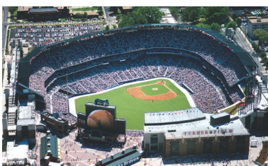
Turner Field Atlanta, Georgia $54.3 million | 1.5 million-SF