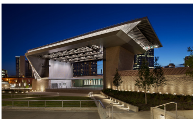
West Riverfront Park Redevelopment Nashville, Tennessee $49 million | 13-acres LEED Gold certified