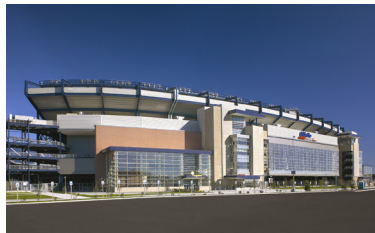
Gillette Stadium Foxboro, Massachusetts $305 million | 1.7 million-SF