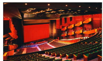
Seattle Center Marion Oliver McCaw Hall Seattle, Washington $95 million | 295,000-SF