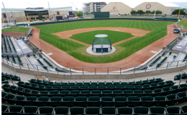
Texas A&M University Olsen Field at Blue Bell Park Renovation College Station, Texas $21 million | 50,000-SF