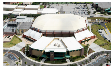
University of South Florida Sun Dome Arena and Convocation Center Renovation Tampa, Florida $33.7 million | 250,000-SF LEED Silver certified