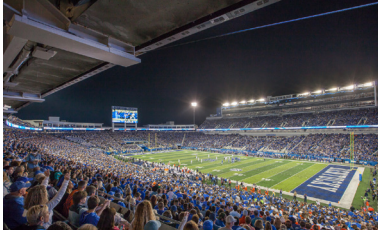
University of Kentucky Commonwealth Stadium Expansion/Renovation Lexington, Kentucky $112 million | 880,170-SF