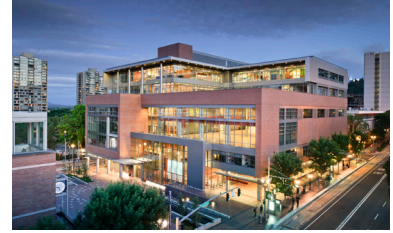
Portland State University Academic & Student Recreation Center Portland, Oregon $69.3 million | 206,000-SF LEED Gold certified