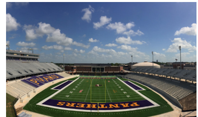
Prairie View A&M University Football Stadium and Athletic Field House Prairie View, TX $61 million | 91,500-SF