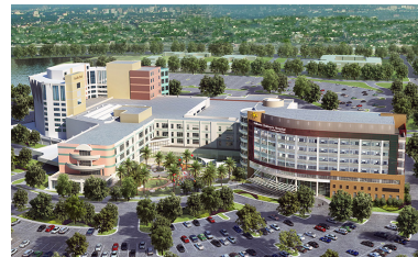
Golisano Children's Hospital of Southwest Florida Ft. Myers, Florida $144 million | 293,000-SF