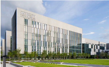
University Medical Center New Orleans, Louisiana $696 million | 1,645,855-SF