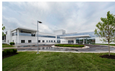
Cleveland Clinic Brunswick Freestanding Emergency Department Brunswick, Ohio $14 million | 60,000-SF