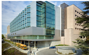
University of Washington Medical Center Montlake Tower Expansion Seattle, Washington $151.2 million | 282,300-SF