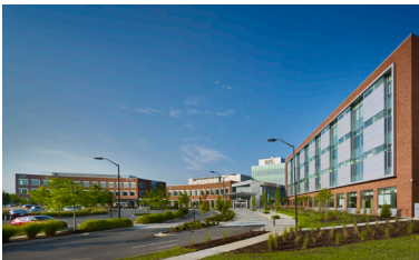
University of North Carolina Hospitals Hillsborough Campus Hillsborough, North Carolina $164.7 million | 315,574-SF Seeking LEED