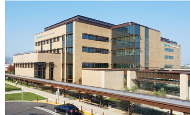
Palo Alto Medical Foundation Outpatient Center Palo Alto, California $166 million | 198,000-SF Integrated Project Delivery