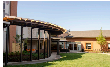
Abe's Garden Alzheimer's and Memory Care Center of Excellence Nashville, Tennessee $14 million | 54,394-SF