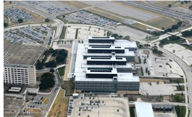
Wilford Hall Ambulatory Surgical Center at Lackland Air Force Base, Phase 2 and 3 San Antonio, Texas $206 million | 700,000-SF Seeking LEED Silver