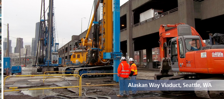
Alaskan Way Viaduct, Seattle, WA