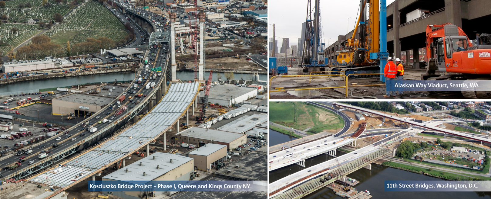
Kosciuszko Bridge Project – Phase I, Queens and Kings County NY