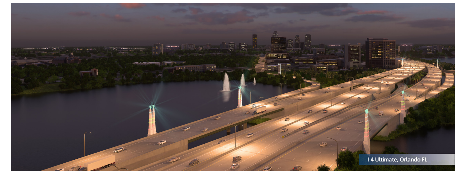
I-4 Ultimate, Orlando FL