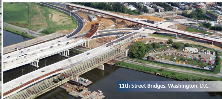
11th Street Bridges, Washington, D.C.