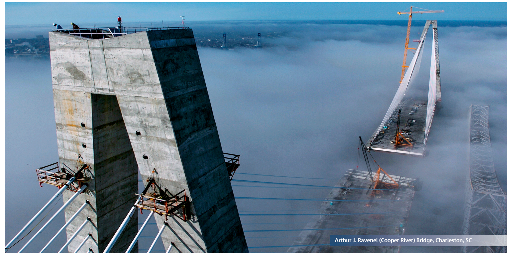
Arthur J. Ravenel (Cooper River) Bridge, Charleston, SC

I-215 Segments 1&2, San Bernardino, CA. Widening of 14 miles of the freeway to create two additional HOV lanes. The major freeway serves as a commuter corridor and a Super Truck Route.